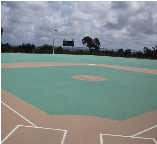
Opening Day, March 2025

However, time has taken its toll. The field's rubberized surface, built to provide a safe and accessible playing experience, is now showing significant wear and tear—posing a growing risk for our players. To ensure that every athlete continues to experience the magic of baseball safely, we must replace the surface with a new, high-quality material designed for durability and performance. In addition, the bleacher shade structure needs replacing and the electronic scoreboard needs updating.